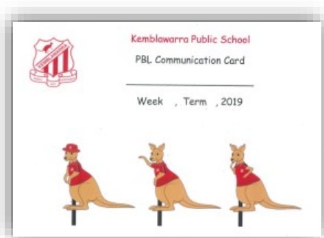
PBL Communication Cards

When discussing your child's behaviour at home, it is important to talk about these statements and discuss these in order for the child to reflect on the actions they have taken throughout the week. If your child is on a behaviour/communication card and you would like further information, please see the class teacher.