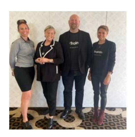
Ontario Canada visit 24/7 Training team experts in science of learning and reading